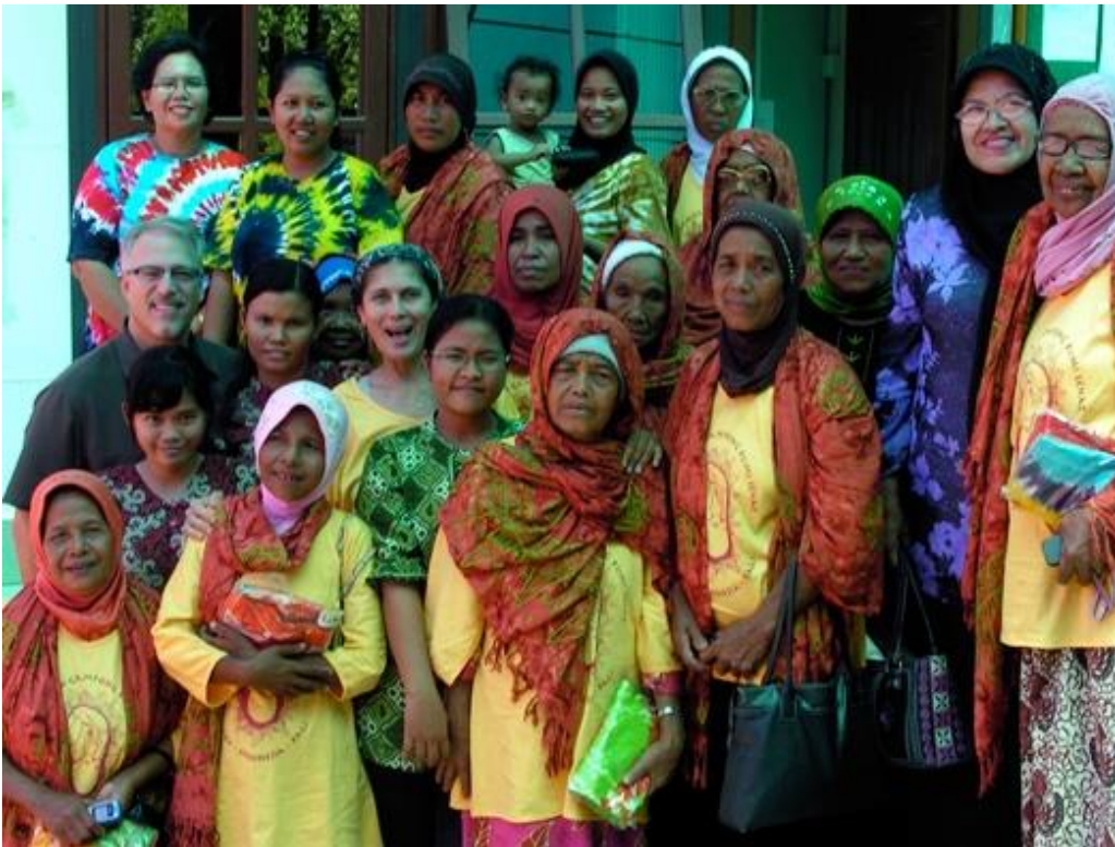
Bumi Sehat Aceh in 2005